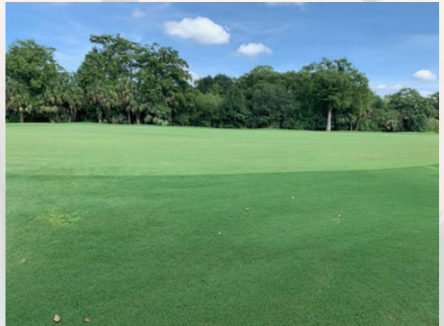
#15 Fairway along our beautiful preserve