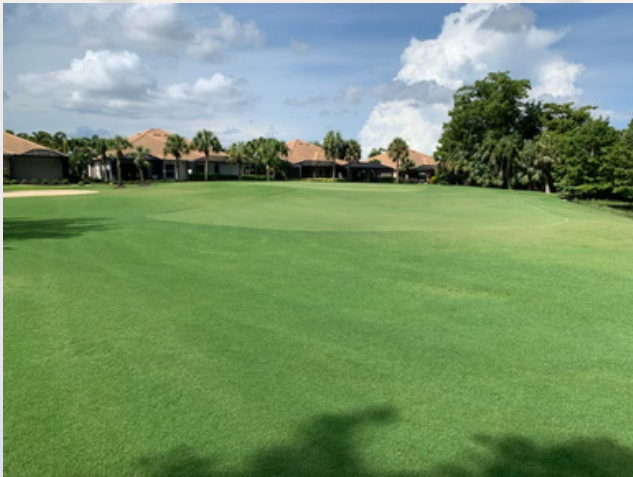
Approach to hole #15